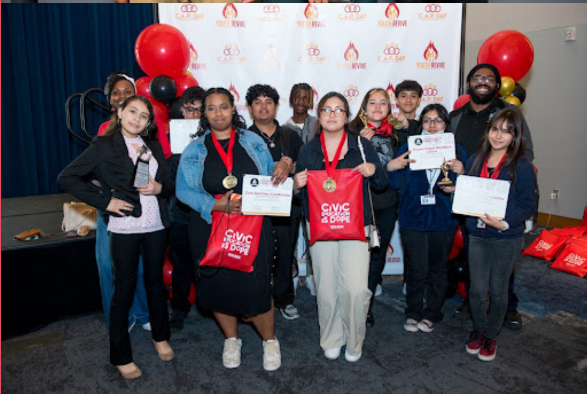
Photos taken during Youth Revive's CAPstone event.